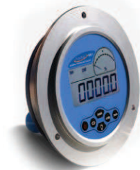
681 Panel mount with back pressure port