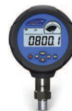
681 with rubber boot