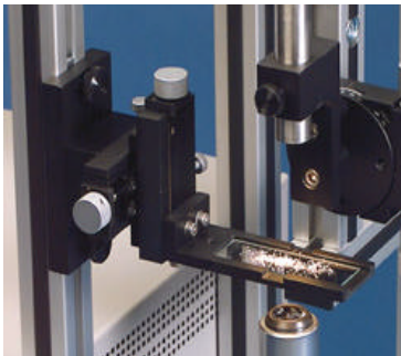
2-D manual slide holder stage

Holds standard microscope slides. Standard equipment on all systems.